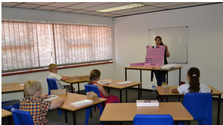
Example of a group class

In larger towns or cities, the standard clinic size applies. The educational model provides 24 learners per 90 minute lesson. A standard clinic has enough capacity to easily accommodate 120 registered learners. The standard clinic offices need to be approximately 80 m 2 in size to make provision for two classrooms, a reception/administrative area and a small conference/reading room. The group class needs to be furnished with 8 learner desks and chairs, as well as a teacher's table.