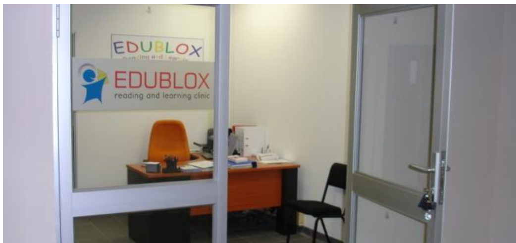
Entrance to the Ballito franchise

For the smaller market — towns with less than 4,000 learners — the initial franchise fee may be reduced by on average 30% and less computers, furniture and office space are required.