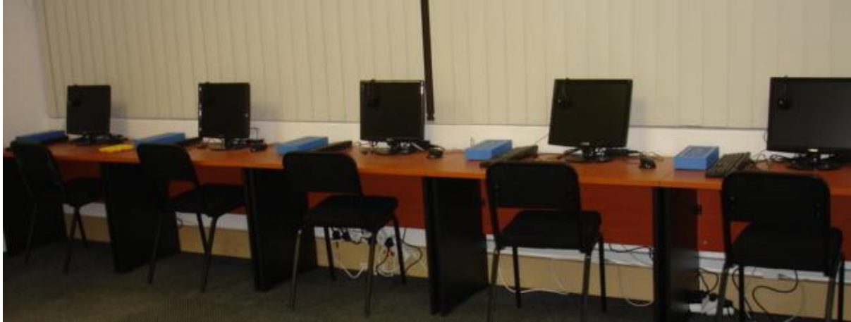
Example of the computer classroom

The computer class has 8 computer workstations, linked through a LAN (local area network) to a server computer with Internet access. The reading area does not need to be in a separate room, part of the reception area may be used. The clinic ideally needs to be situated as part of a shopping centre or in offices close to a shopping centre.